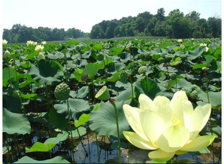
Scenic views in the East Sandusky Bay